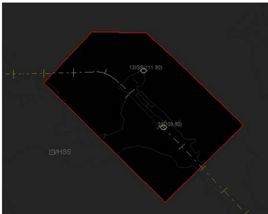
Figure 10.1: Location of VHHX ATZ in relations to other control zones.

10.1.3. The boundary of the Kai Tak ATZ is a rectangle with its edges extending two (2) nautical miles from RWY 13/31. Certain parts of the Kai Tak ATZ fall into Port Shelter (PSH) UCARA. The boundary of UCARA shall prevail, and, as such, the boundary of Kai Tak ATZ on the northeast side where it overlaps with UCARA shall follow the boundary between Island Zone and UCARA instead.