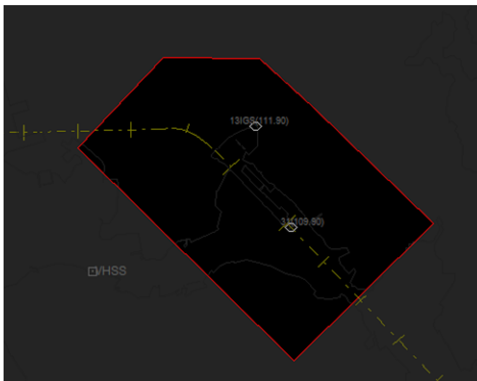
Figure 10.1: Location of VHHX ATZ in relations to other control zones.

10.1.3. The boundary of the Kai Tak ATZ is a rectangle with its edges extending two (2) nautical miles from RWY 13/31. Certain parts of the Kai Tak ATZ fall into Port Shelter (PSH) UCARA. The boundary of UCARA shall prevail, and, as such, the boundary of Kai Tak ATZ on the northeast side where it overlaps with UCARA shall follow the boundary between Island Zone and UCARA instead.